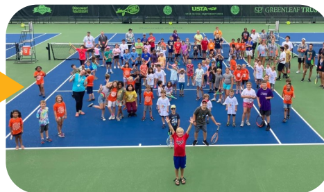
608 youths participated in tennis programs across Maple and Portage Y's.