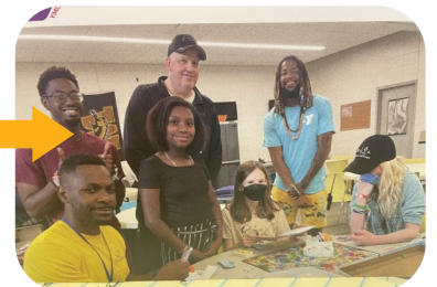
139 teens took part in afterschool programming, and 427 youth were enrolled in Prime Time (before and after school program.)