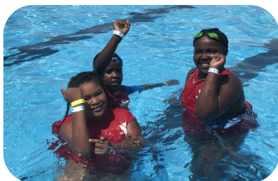
834 youths participated in swimming and drowning prevention programs.